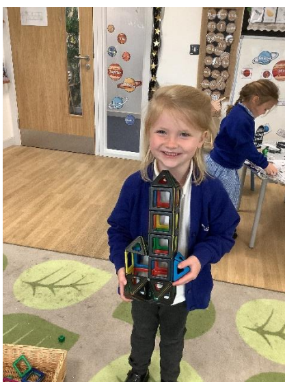
Our out of this world antics!